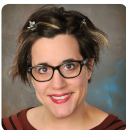
Journey of Addiction Through Recovery