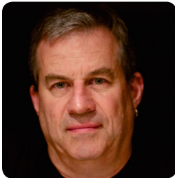
Dreamland: America's Opiate Epidemic and How We Got Here

DECEMBER 4 AND 5, 2018 | HILTON EASTON COLUMBUS | 3900 CHAGRIN DRIVE | COLUMBUS, OHIO 43219