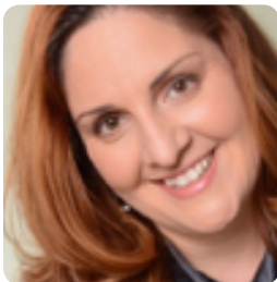
Stigma of Addiction